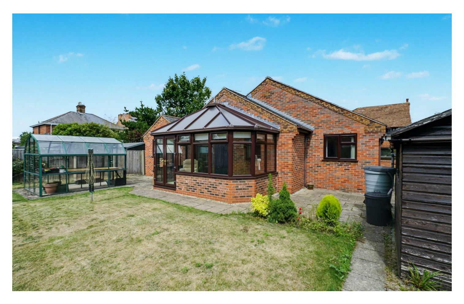
THIS IS AN INDIVIDUAL TWO DOUBLE BEDROOM DETACHED BUNGALOW SITUATED AT THE HEAD OF A QUIET CUL-DE-SAC CLOSE TO THE CENTRE OF LONG EATON.

Being located on East Street, this detached bungalow was built approximately 30 years ago and provides a lovely, spacious home with private gardens to the rear. The property is being sold with the benefit of NO UPWARD CHAIN and for the size of the accommodation and privacy of the rear garden to be appreciated, we recommend interested parties do take a full inspection so they are able to see all that is included in this lovely property for themselves. Although the property is situated on a quiet cul-de-sac, it is only a few minutes walk away from the centre of Long Eaton and therefore close to all the amenities and facilities provided by the town centre and surrounding area.